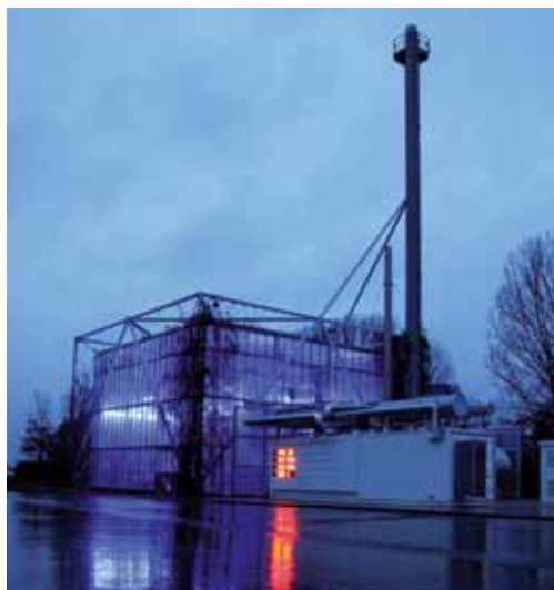
Co-generator powered by renewable raw materials